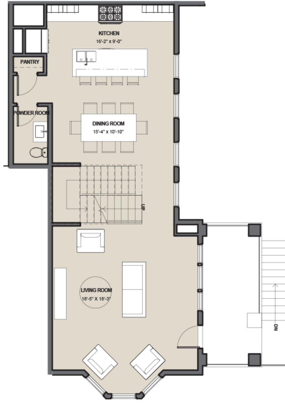
UNIT 11 - FIRST FLOOR PLAN