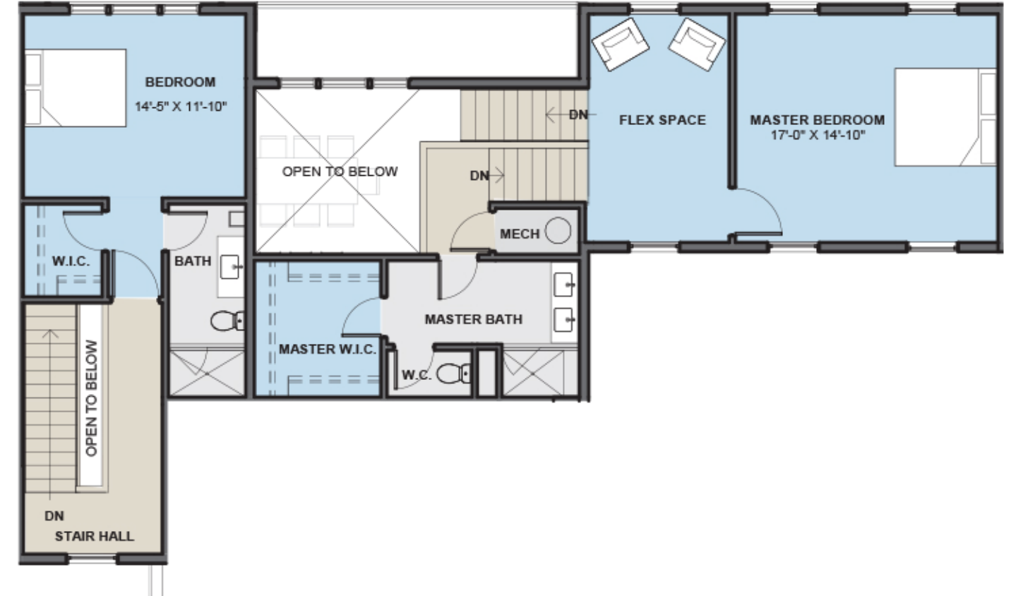
UNIT 6 - SECOND FLOOR PLAN